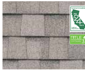
Mist White CRRP Product ID 0668-0071