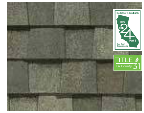
Weathered Wood CRRP Product ID 0668-0119