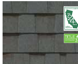
High Index* Moonstone CRRP Product ID 0668-0163