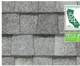
Birchwood CRRP Product ID 0668-0084