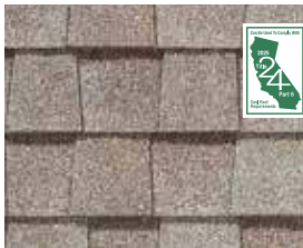
Mojave Tan CRRP Product ID 0668-0115