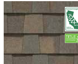
High Index* Sand Dune CRRP Product ID 0668-0164