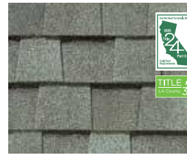
Georgetown Gray CRRP Product ID 0668-0116