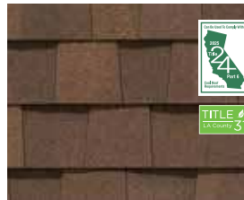
High Index* Redwood Canyon CRRP Product ID 0668-0165