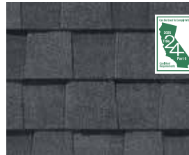
Moiré Black CRRP Product ID 0668-0129