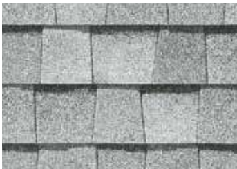
Silver Birch CRR Product ID 0668-0072