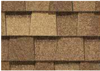
Resawn Shake CRR Product ID 0668-0118