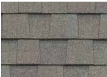
Aged Cedar CRR Product ID 0668-0055