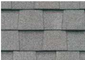
Crystal Gray CRR Product ID 0668-0058