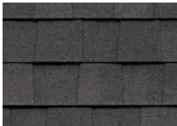
Graphite CRR Product ID 0668-0155