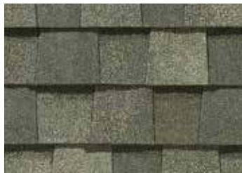
Weathered Wood CRR Product ID 0668-0119