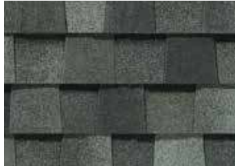
Thunderstorm Gray Available in Utah only