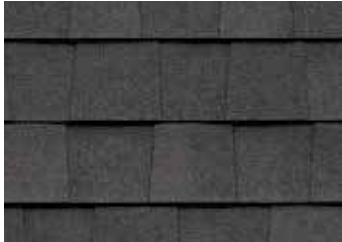
Graphite CRRC Product ID 0668-0155