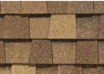
Resawn Shake CRRC Product ID 0668-0118