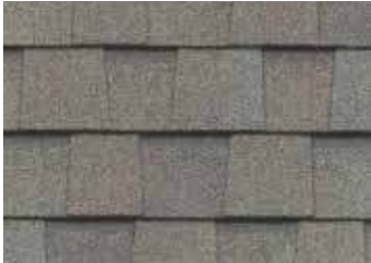
Aged Cedar CRRC Product ID 0668-0055