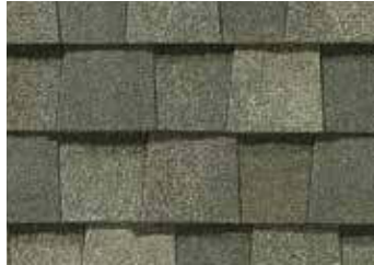
Weathered Wood CRRC Product ID 0668-0119