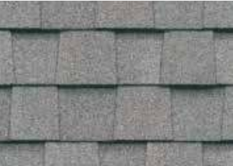
Crystal Gray CRRC Product ID 0668-0058