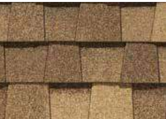
Resawn Shake CRRC Product ID 0668-0118