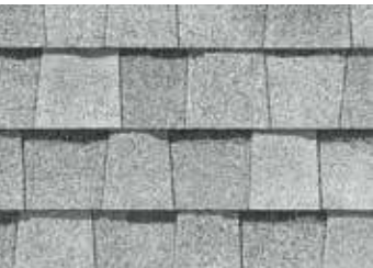
Silver Birch CRRC Product ID 0668-0072