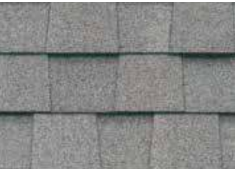
Crystal Gray CRRC Product ID 0668-0058