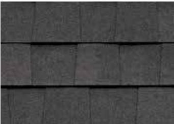
Graphite CRRC Product ID 0668-0155