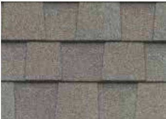
Aged Cedar CRRC Product ID 0668-0055