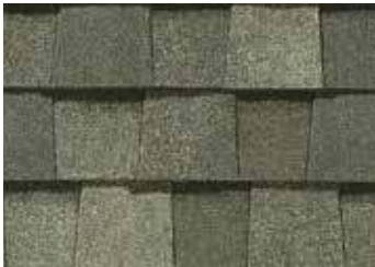
Weathered Wood CRRC Product ID 0668-0119