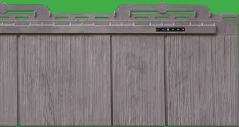
Cedar Impressions Single 7" panel